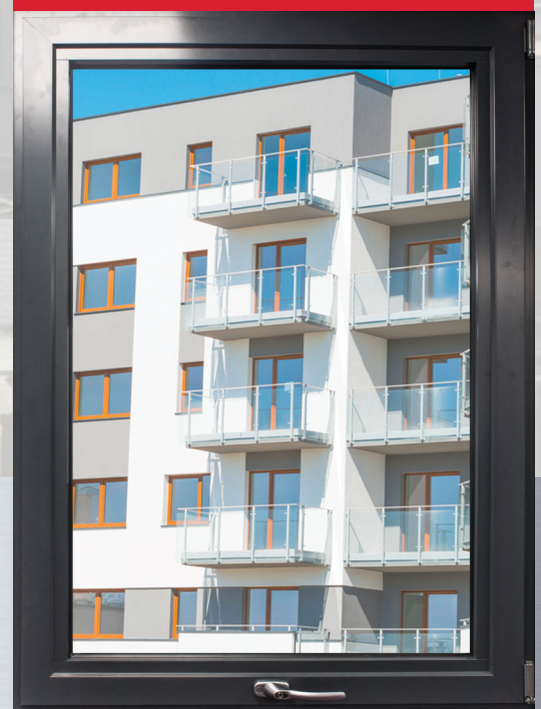
Life Enhancing Turn & Tilt Window